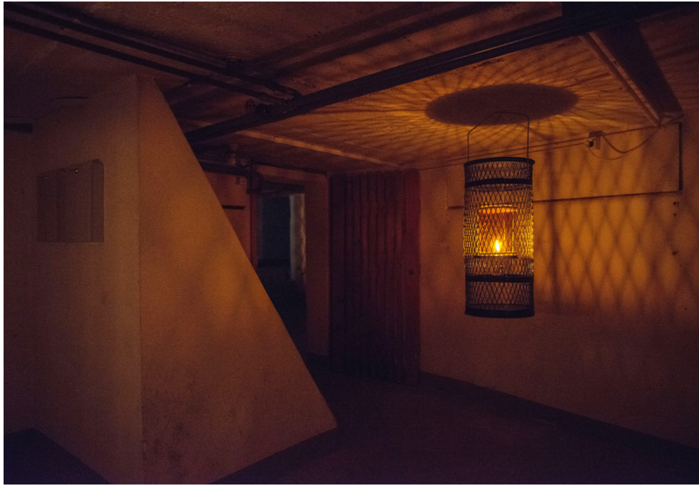
Canaries in a cold mine, 2020

Canaries in a cold mine is a series of hanging, lamp-like sculptures. They are built in a way, that allows them to monitor the air quality in the spaces where they are exhibited. In doing so, they reassure visitors that they are in a safe environment, but they also remind them, that this could potentially change from one moment to the next.