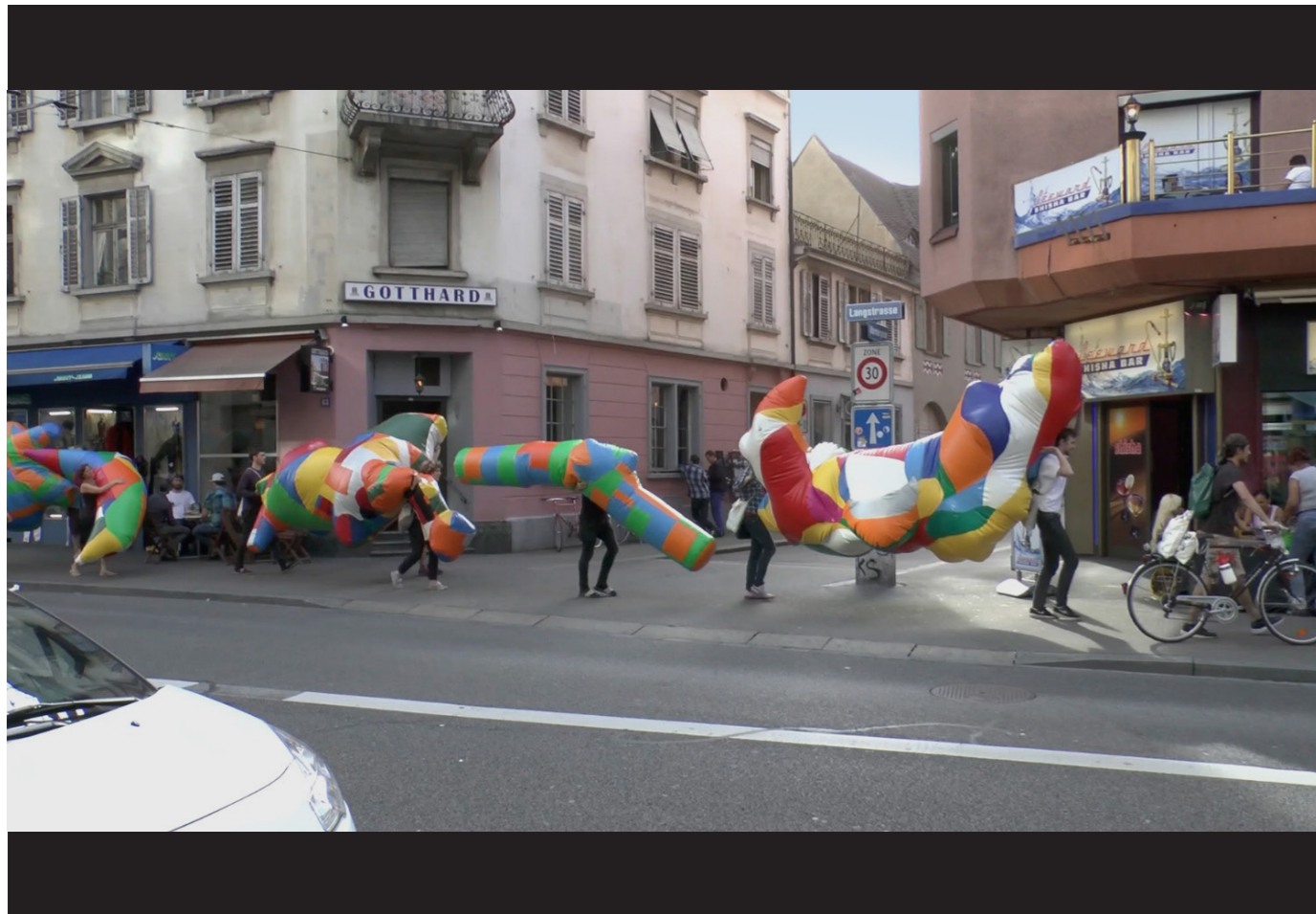
The first iteration of Service Public going from Mythenquai to my studio at Sihlquai in Zurich, 2016

Half a year later I was given the chance to show this work at Aargauer Kunsthaus. On that occasion I realized a second transport. In the exhibition people would not see the objects but a video documenting the transport to the museum. In this way the work has been traveling to many other places since.