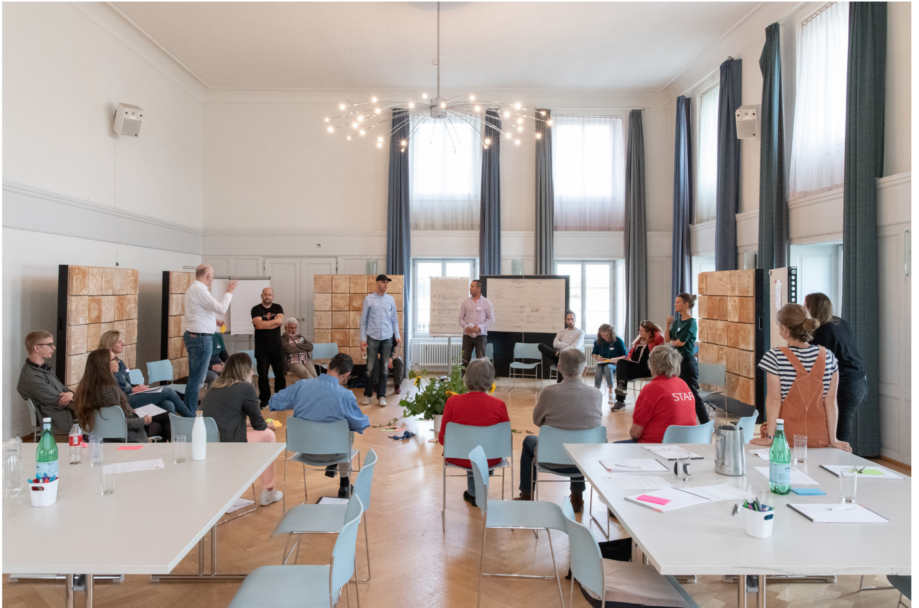
The New New Material at the Citizens panel of Uster, 2021