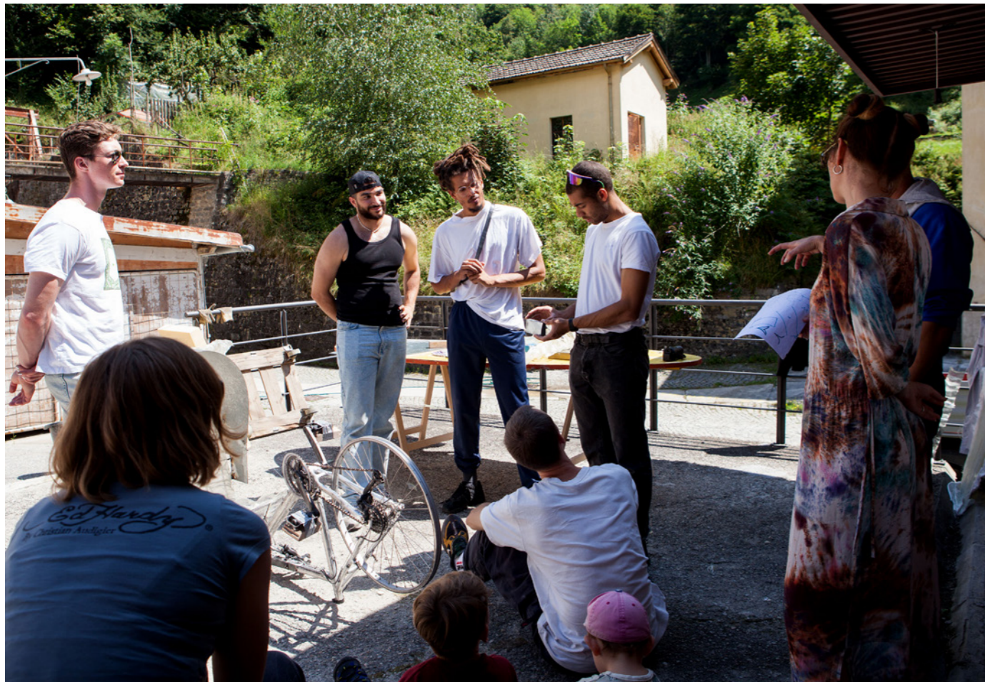
Impressions from Santa Barbara in Torre

Video documentation to Santa Barbara in Torre