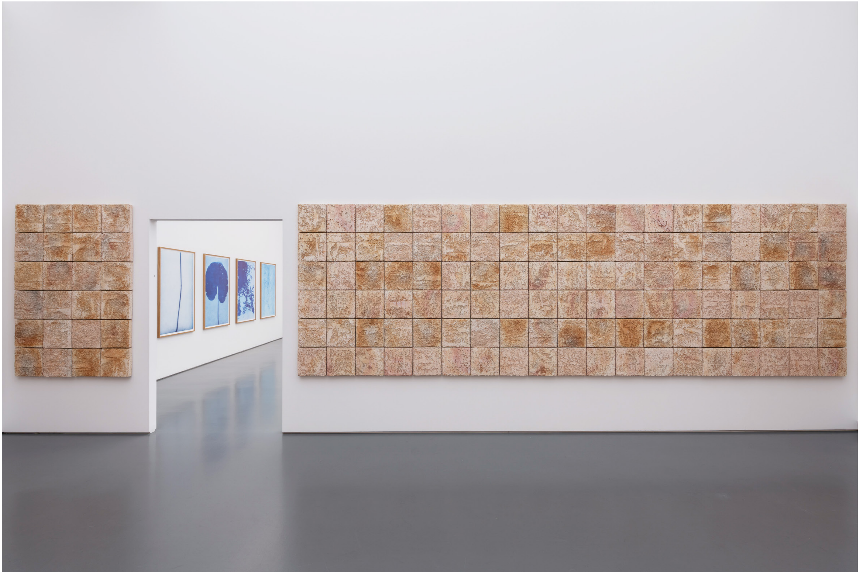
The New New Material at Aargauer Kunsthau, 2019