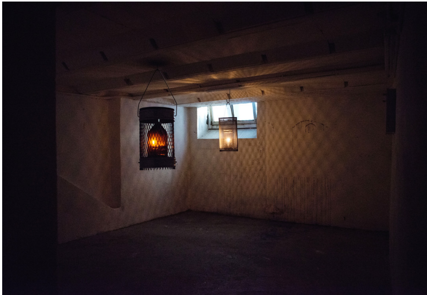
Installation views of Canaries in a cold mine at Bella, Zurich

Canaries in a cold mine is a series of hanging, lamp-like sculptures. They are built in a way, that allows them to monitor the air quality in the spaces where they are exhibited. In doing so, they reassure visitors that they are in a safe environment, but they also remind them, that this could potentially change from one moment to the next.