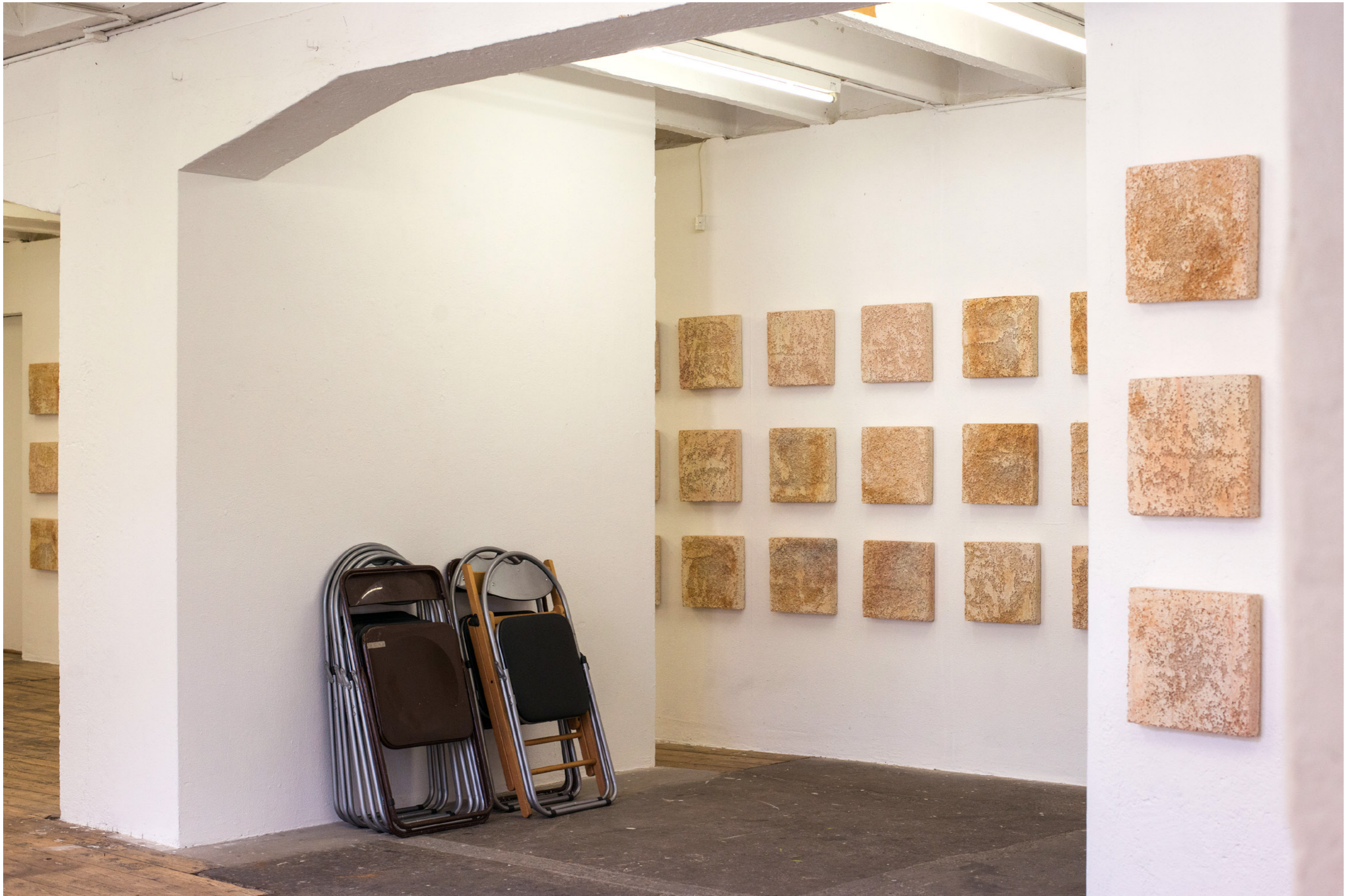
The New New Material at BINZ39, 2020