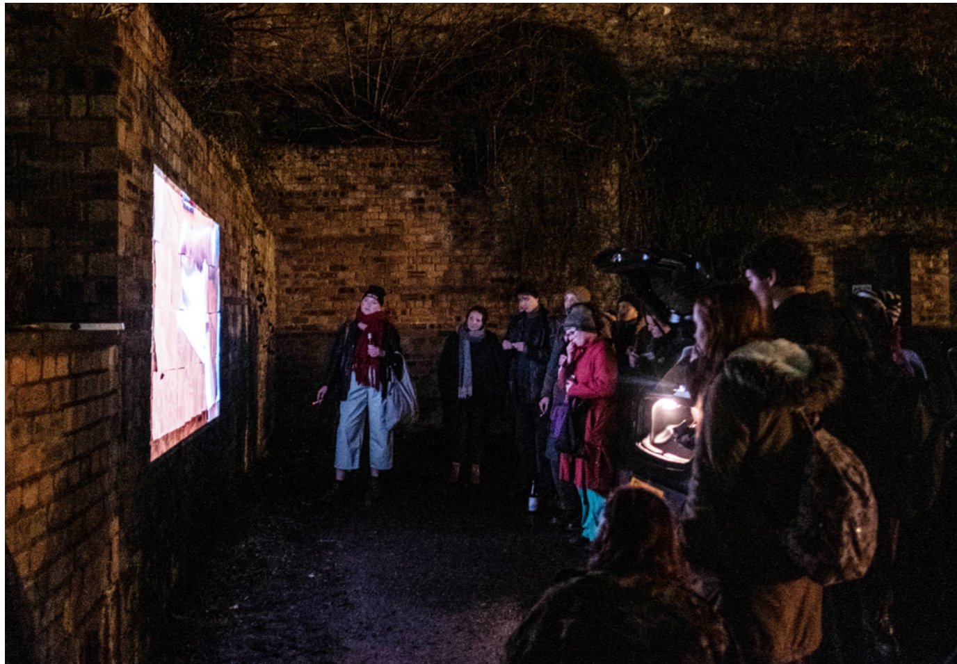
Screening Groundwork at Woosh Gallery in Dundee, Scotland