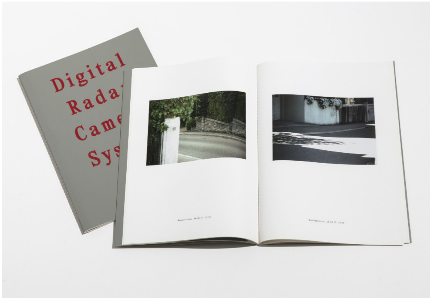
Meeting with the Zurich traffic police for Digital Radar Camera System

Since 2015 we are continuing this work as a series of photo prints. So far this series consists of 8 pictures.