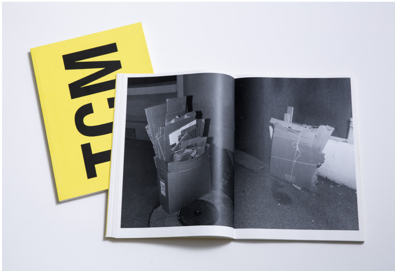
Shooting at night for The Careful Movers , Zurich

To preserve these telling one night sculptures I documented them in a series of photographs.